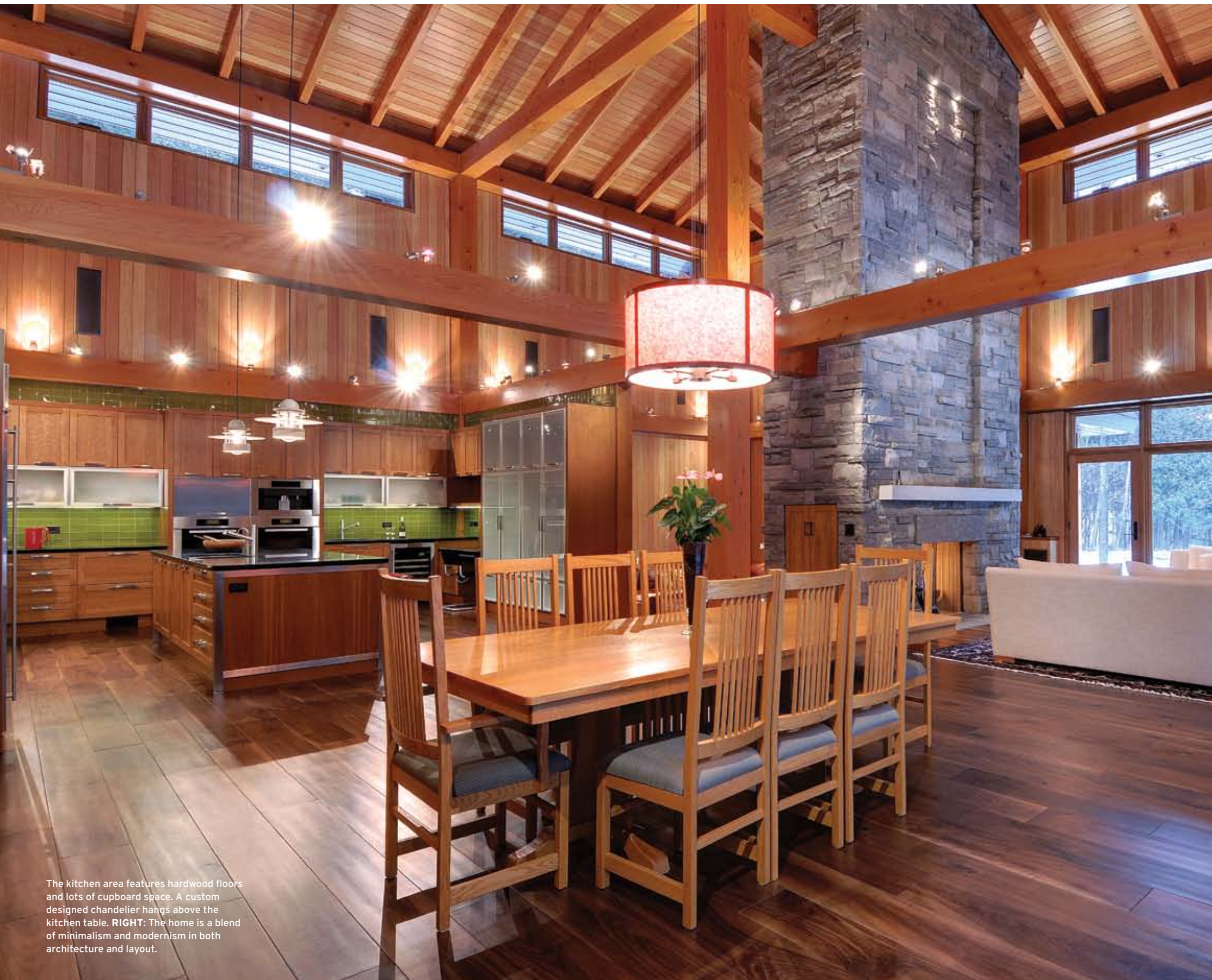
The kitchen area features hardwood floors and lots of cupboard space. A custom designed chandelier hangs above the kitchen table. RIGHT: The home is a blend of minimalism and modernism in both architecture and layout.