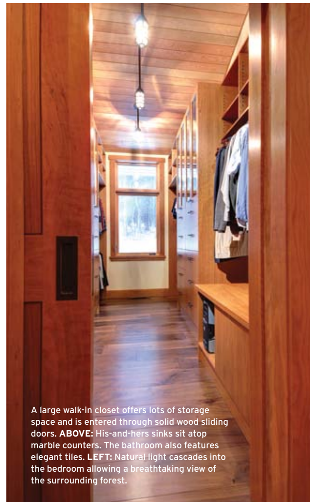
A large walk-in closet offers lots of storage space and is entered through solid wood sliding doors. ABOVE: His-and-hers sinks sit atop marble counters. The bathroom also features elegant tiles. LEFT: Natural light cascades into the bedroom allowing a breathtaking view of the surrounding forest.