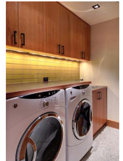
TOP: A large double-sided fireplace keeps resting spaces warm all year long. LEFT: A sunken tub and walk-in shower offer the perfect home spa retreat. ABOVE: The laundry room has lots of work space and state-of-the-art appliances.