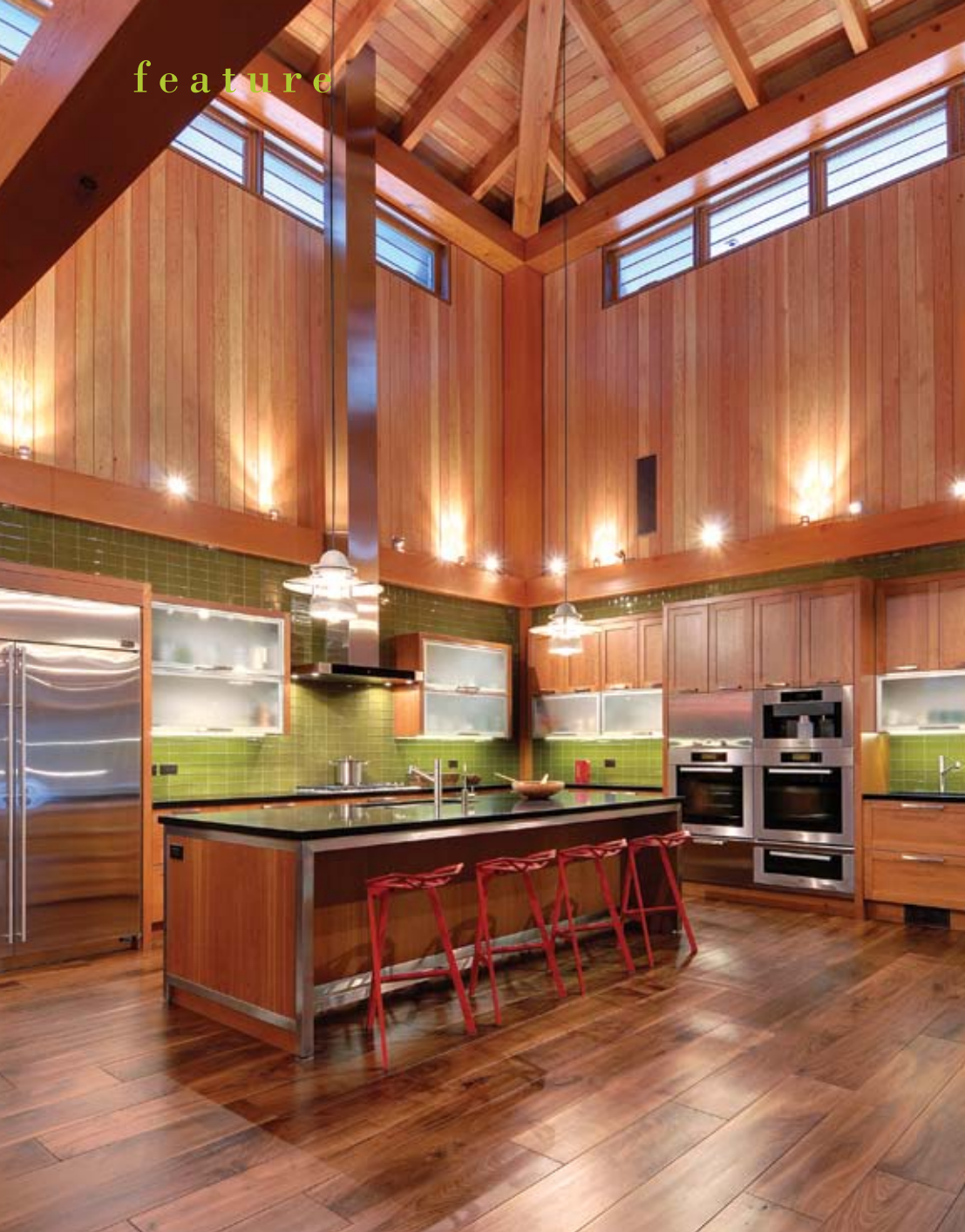
LEFT: Built-in appliances add an extra touch of sophistication to the kitchen area. BELOW: Stainless steel sinks make for quick and easy clean up. A bright green backsplash adds a shot of colour to the room. BOTTOM: Vaulted ceilings can be found throughout the main floor. The 35-foot ceilings are constructed from 12-by-12 inch Douglas-fir beams.